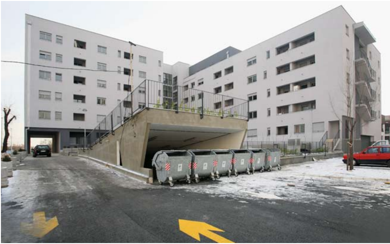
↑ In contrast to the dynamic street facade, the rear, facing the mega-structures, has a light and clean appearance.